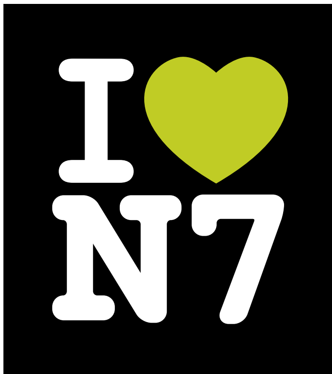
I HEART N7 DESIGN